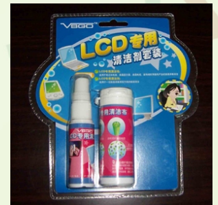
LCD clean kits