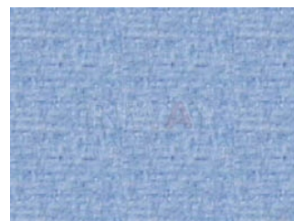
Cloth Common Model